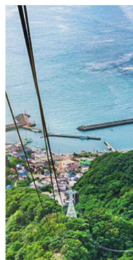
Futtsu Beach House