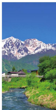
Hakuba Mountain Lodge