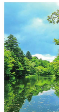
Karuizawa Mountain Lodge